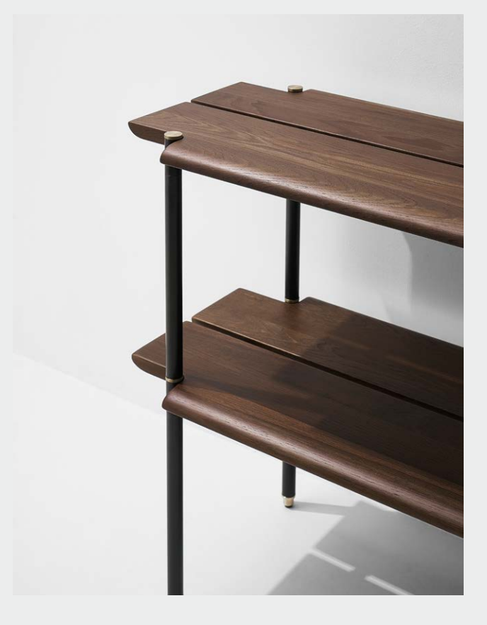
Oak top / Blackened steel legs / Brass

Designed to effortlessly move from seating to shelving this unique Stacking Bench create distinct storage options. Crafted from blackened steel and highlighted with brass details.