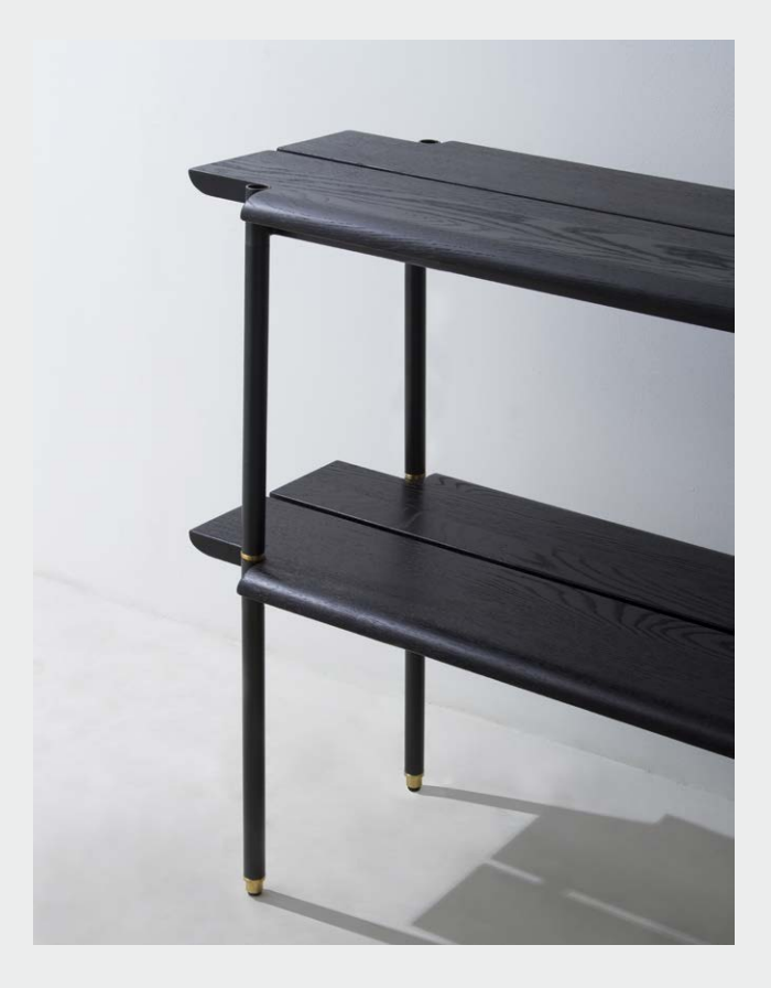
Oak top / Blackened steel legs / Brass

Designed to effortlessly move from seating to shelving this unique Stacking Bench create distinct storage options. Crafted from blackened steel and highlighted with brass details.