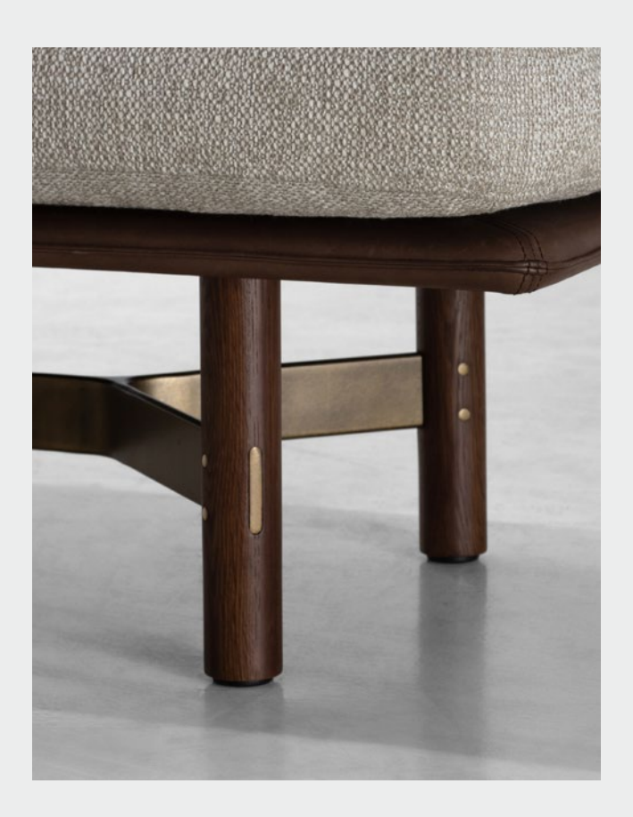
Oak frame / Steel structure / Upholstered platform & cushion