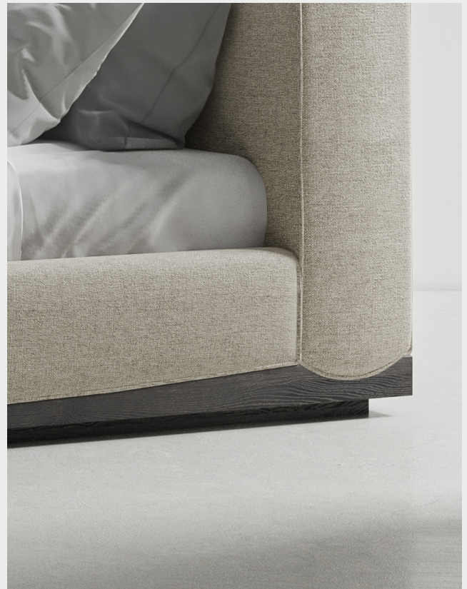
Oak base / Upholstered headboard & rails