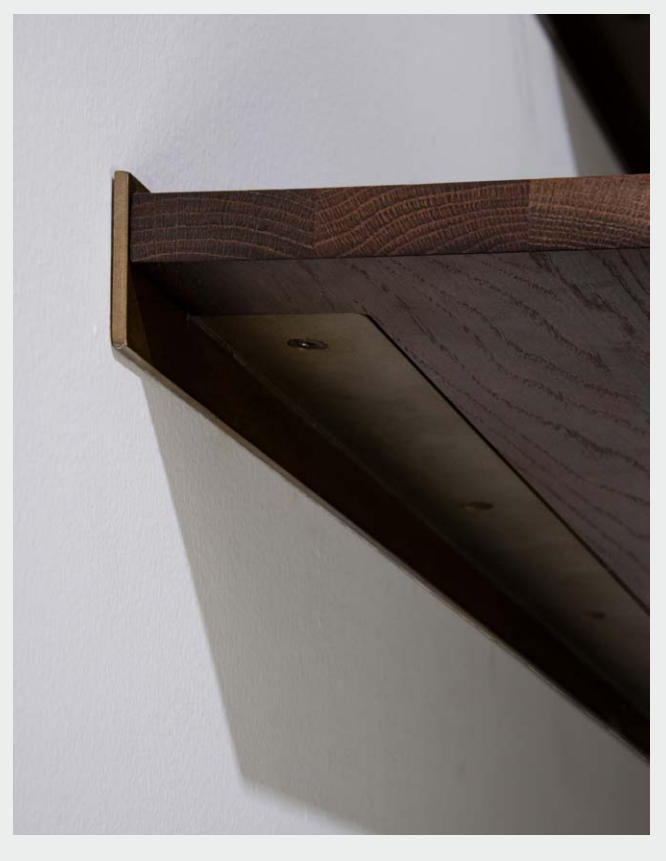
Oak frame / Antique brass steel top, drawer pulls & wall-mount

The Drift storage collection includes shelves, cabinets and drawers to create a functional wall system that allows to organise home & office. All are made from oak veneer and oak, with steel tops and hand-crafted brass drawer pulls.